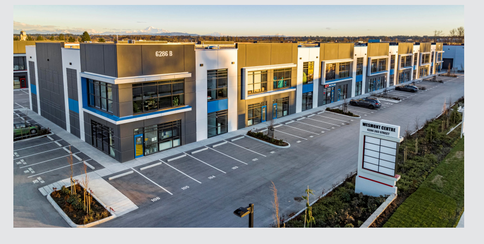
119,887 sf over three buildings