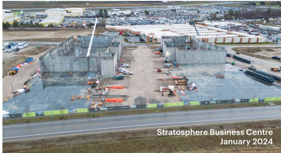
Stratosphere Business Centre January 2024