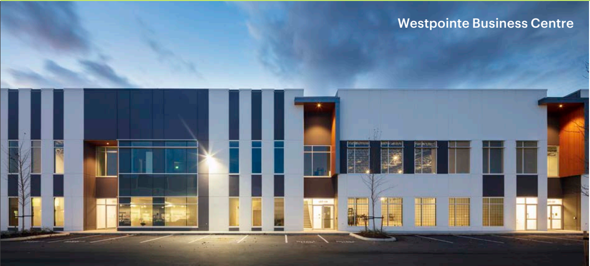
Westpointe Business Centre

Since 1954, Beedie has combined innovation and craftsmanship to bring new possibilities to life. Today, we are one of Western Canada's largest industrial and residential developers, having completed more than 35 million square feet of new development. Our integrated structure allows us to implement the highest construction and design standards, and our legacy of relationship building enables us to deliver projects that drive commercial value. As Beedie grows our operations across North America, we have industrial building opportunities available in British Columbia, Alberta, Ontario, and Las Vegas.