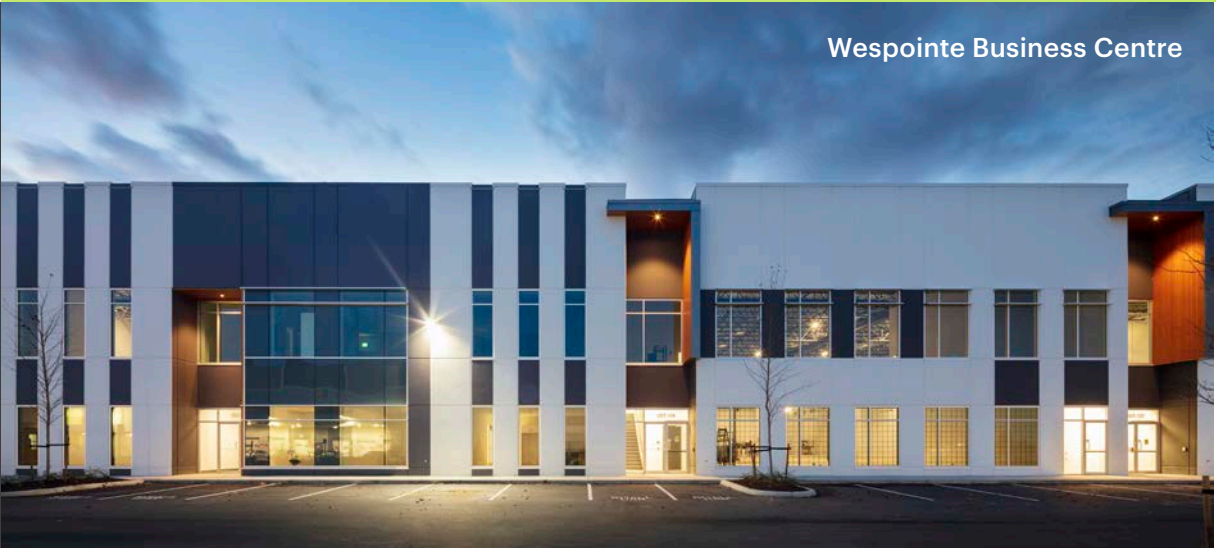
Wespointe Business Centre

Since 1954, Beedie has combined innovation and craftsmanship to bring new possibilities to life. Today, we are one of Western Canada’s largest industrial and residential developers, having completed more than 35 million square feet of new development. Our integrated structure allows us to implement the highest construction and design standards, and our legacy of relationship building enables us to deliver projects that drive commercial value. As Beedie grows our operations across North America, we have industrial building opportunities available in British Columbia, Alberta, Ontario, and Las Vegas.