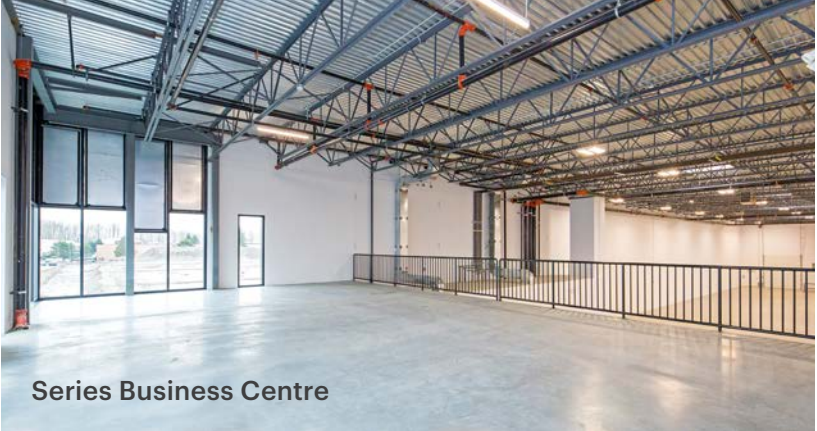
Series Business Centre