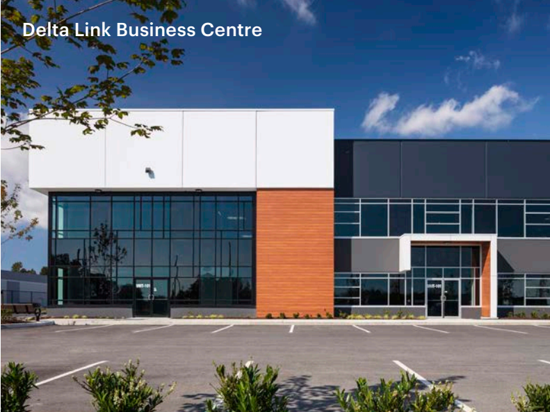
Delta Link Business Centre

Whether you are an owner or tenant at Stratosphere, Beedie will be there to support you every step of the way, creating a seamless experience to meet your property needs, leaving you free to focus on your business.