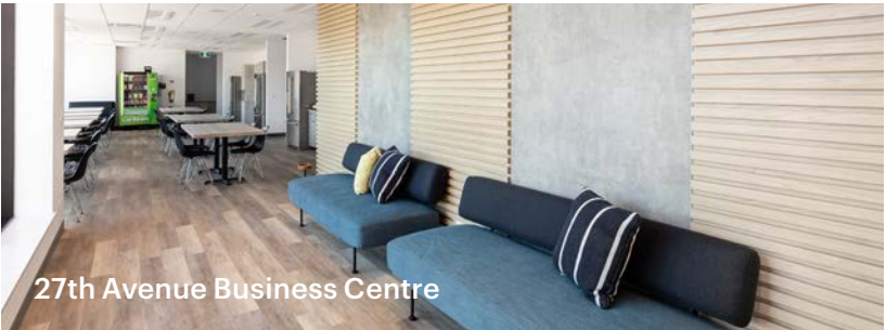
27th Avenue Business Centre