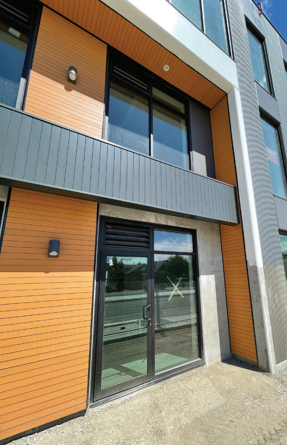
CLEMENT AVENUE ENTRANCE