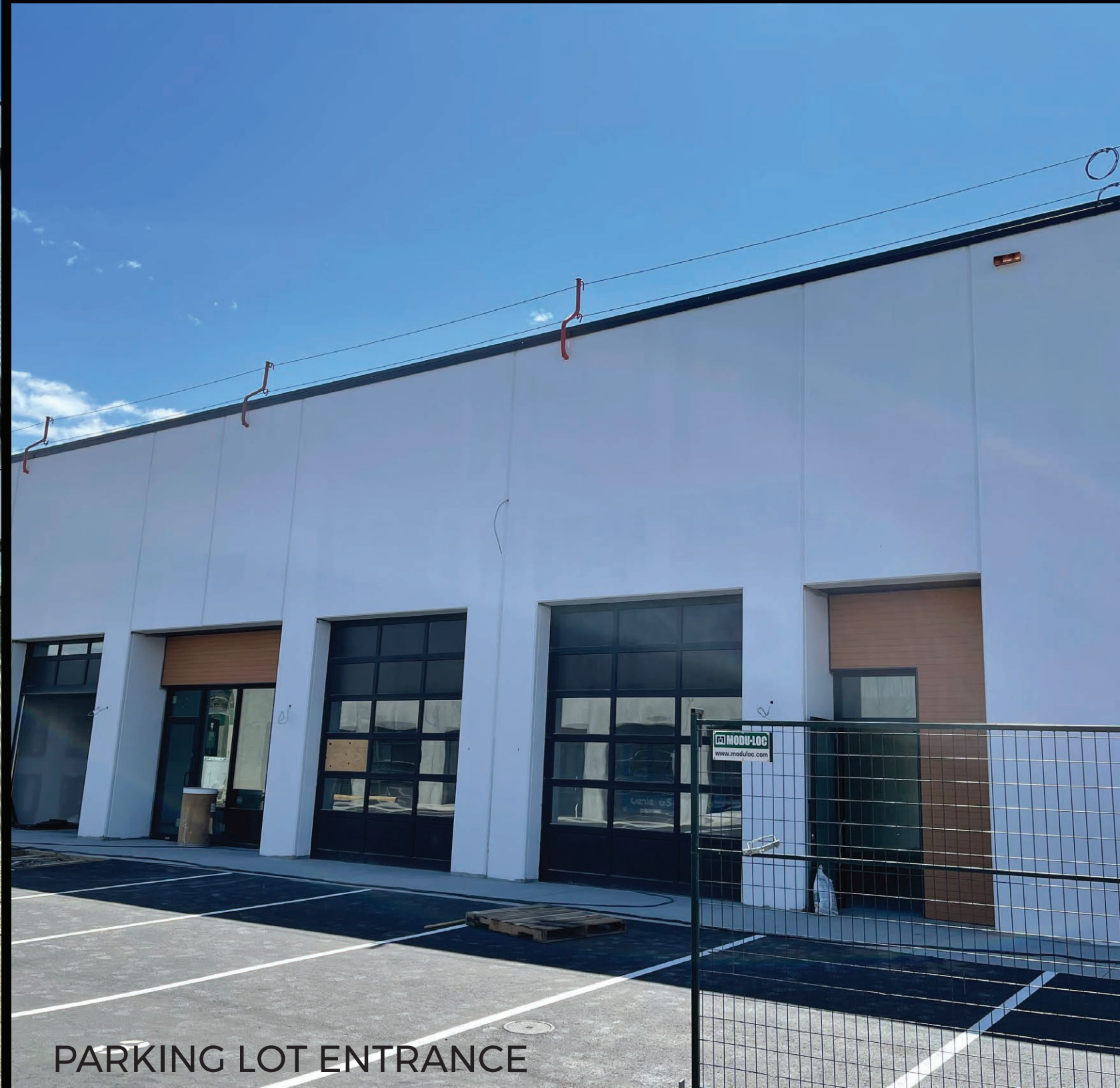
PARKING LOT ENTRANCE