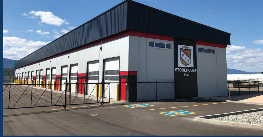
* Storehouse Kelowna