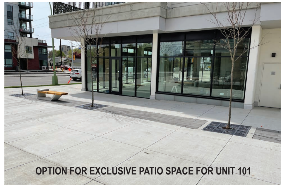
OPTION FOR EXCLUSIVE PATIO SPACE FOR UNIT 101